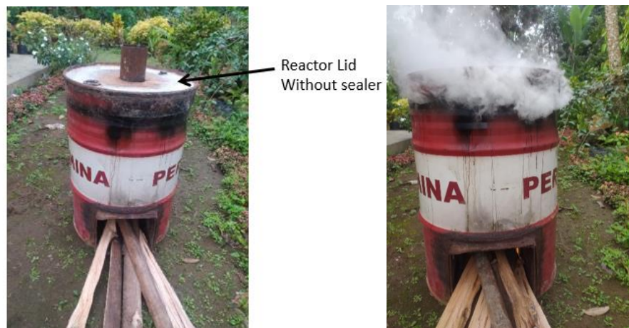
Figure 4. Thick smoke produced by kiln without sealer

but is significantly reduced from the first attempt (Figure 5). Full kiln capacity of 25 kg yielding 48% of the charcoal (Table 4, Figure 6)