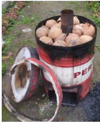
Figure 3. The coconut shells were arranged neatly to fill up the kiln.