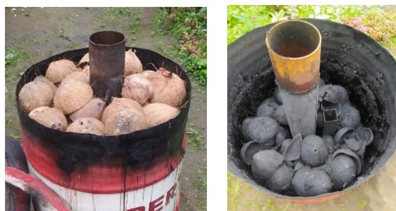
Figure 6. Kiln capacity before and after the carbonization process