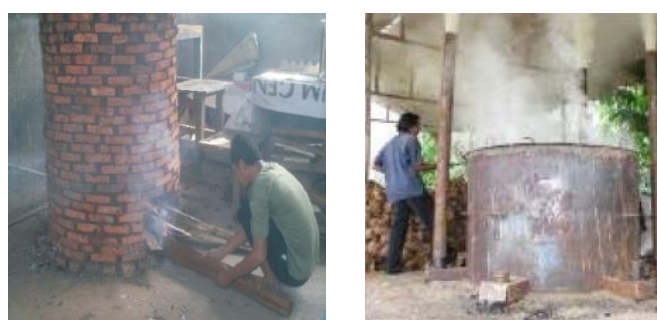
Figure 1. The carbonization process created a lot of smoke that pollutes the air