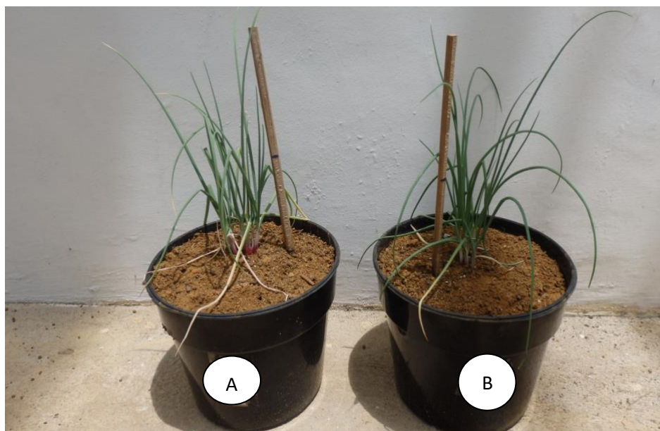
Figure 1. Shallot plants aged 45 DAP under drought stress conditions. Note; (A) sensitive varieties and (B) tolerant varieties

As confirmed by Battaglia and Covarrubias (2013) , it is revealed that plants try to adapt to drought stress through increased synthesis and activation of certain proteins. According to Battaglia et al. (2008) , these specific proteins are called LEA proteins (the late-embryogenesis-abundant proteins) which will be active as protectors when plants experience abiotic stress, including drought stress. It was further disclosed that the LEA protein was composed of 11 amino acids arranged in an amphiphilic-helical form, and was present in the leaves in an amount ranging from 0.5-2.5% of the total protein. LEA protein functions in a protection system against superoxide compounds that are often formed in drought-stressed plant conditions. This is in line with the opinion of Das and Roychoudhury (2014) which states that superoxide formed during stress will greatly damage lipids and proteins.